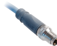
0,2m PUR cable with M8 male 3-pole